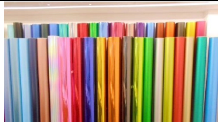
4. Car Wrap Vinyl