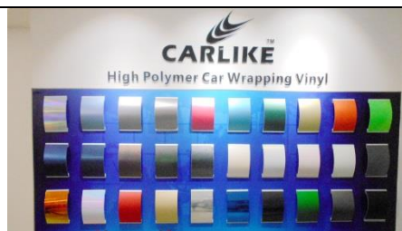
1. Car Wrap Vinyl