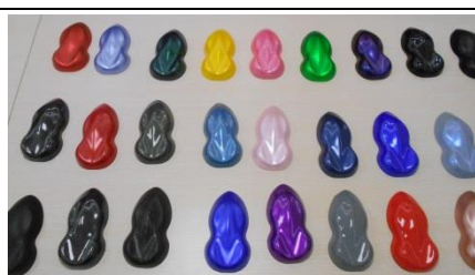
2. Car Wrap Vinyl