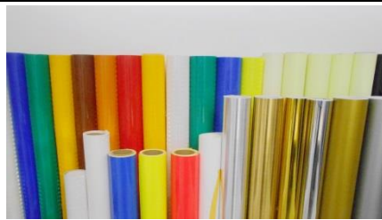
5. Cutting Vinyl